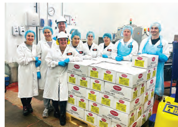
Every employee pictured was once a client at JVS Toronto.

Working with Pelman Foods Employer Services